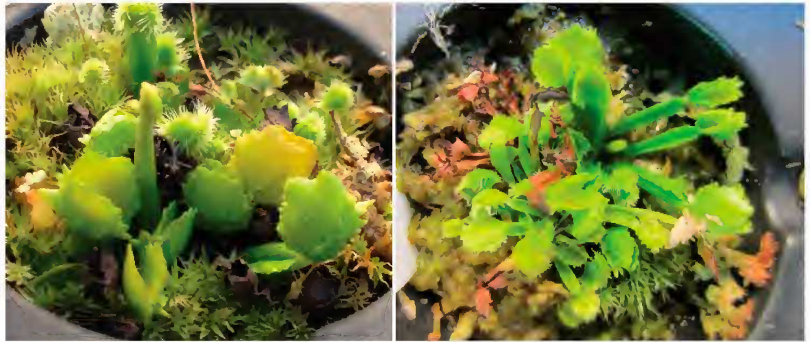
Figure 8: Dionaea 'St. Patrick's Beard' has downward pointing beard-like protrusions on the base of intermediate traps transitioning from entirely "fuzzy" backed traps toward traps somewhat resembling a strange combination of Dionaea 'Cupped Trap' and Dionaea 'Wacky Traps'.